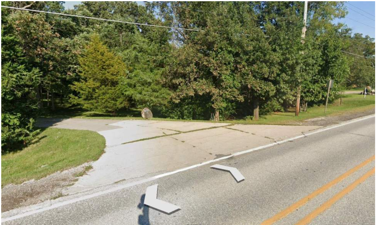
View from end of driveway facing east/southeast showing the screening from NW Beaver Drive. All of the mature trees along this tree-line will be removed during construction of the City project.