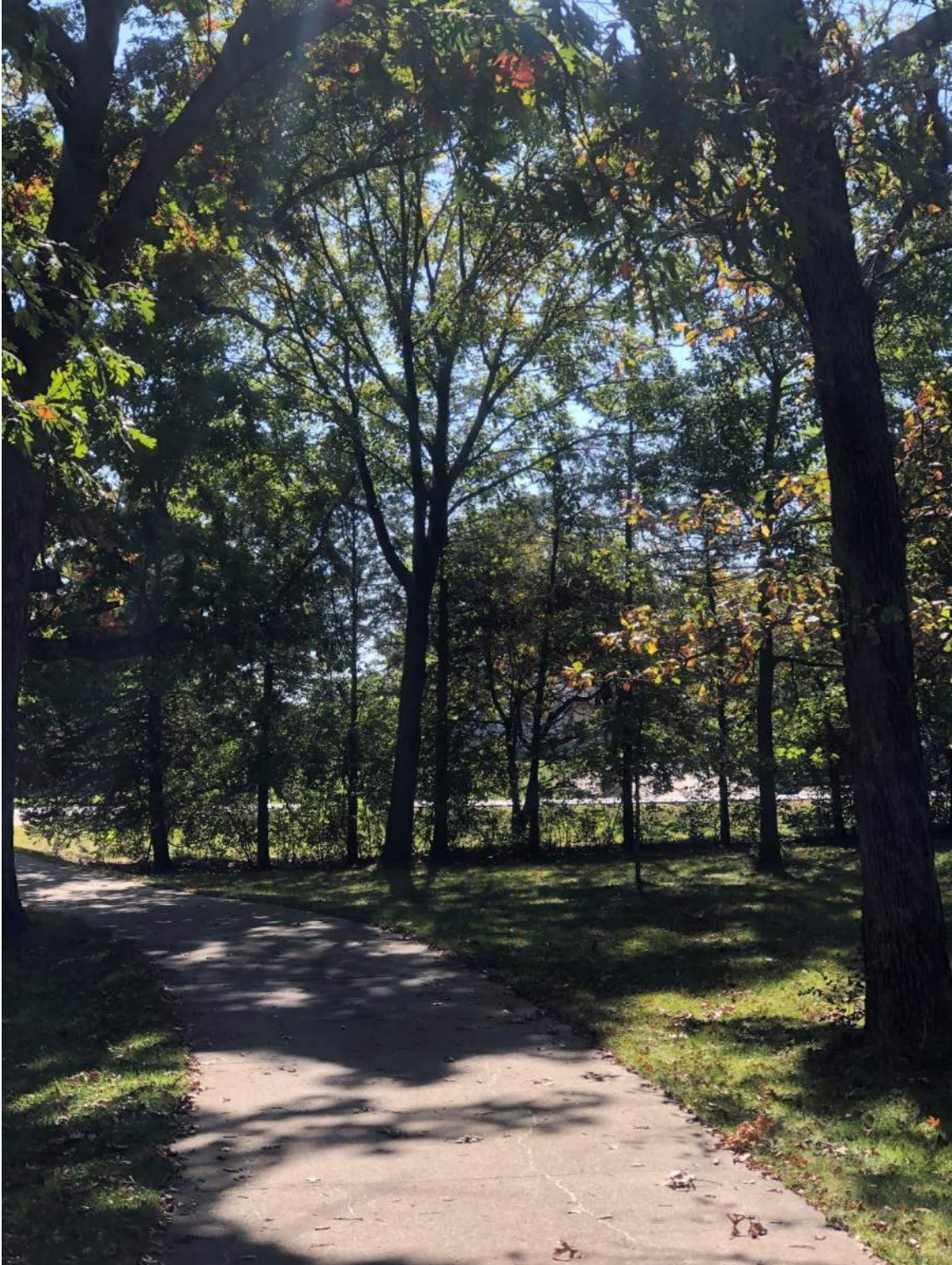
View from the Gerke driveway facing NW Beaver Drive. Large trees in foreground will not be impacted; but the row of cedar and other deciduous trees along ROW which provides screening from NW Beaver Drive will be removed due to project construction.