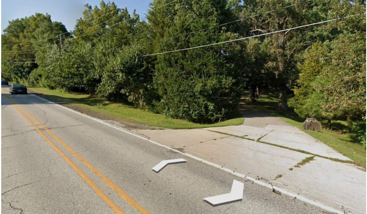
View from end of driveway facing north/northwest showing the screening from NW Beaver Drive. All of the mature trees along this tree-line will be removed during construction of the City project.