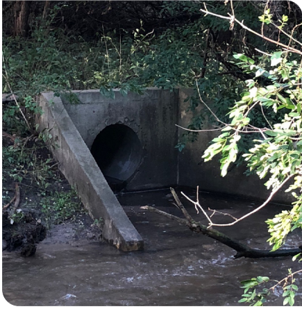
Chlorinated and salt water from pools and spas could directly enter nearby streams discharged into a storm sewer intake.