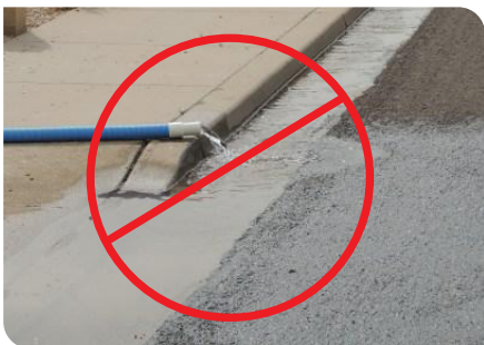
Improper draining of pool backwash onto impervious surface leading to a storm sewer intake. (Cape Water Harvest)